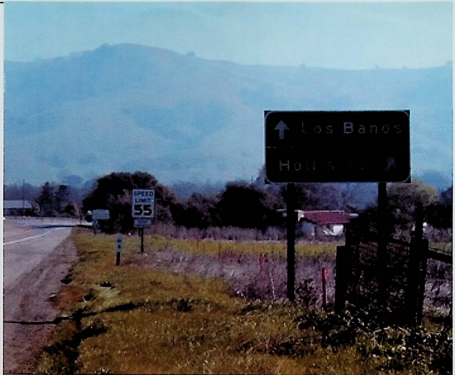
Proof that Casa de WorldCon's Home is in the Middle of Everything!