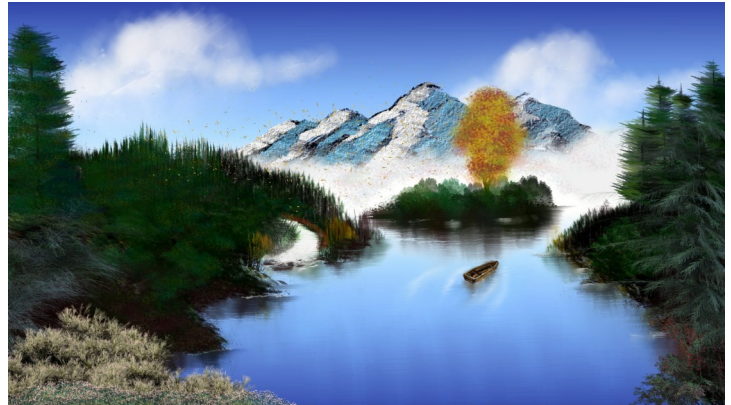
Boat to Golden Island—Tiffanie Gray