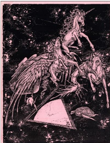
File 770, #61, September 1986

The APA mailing listings are a work in progress so both be kind, and send us info and corrections for any gaps or errors that you see. If you can help identify APA mailings for fanzine titles, please send them to us. OR if you have Inventory sheets for APA mailings and can scan or copy them, please send them to us.