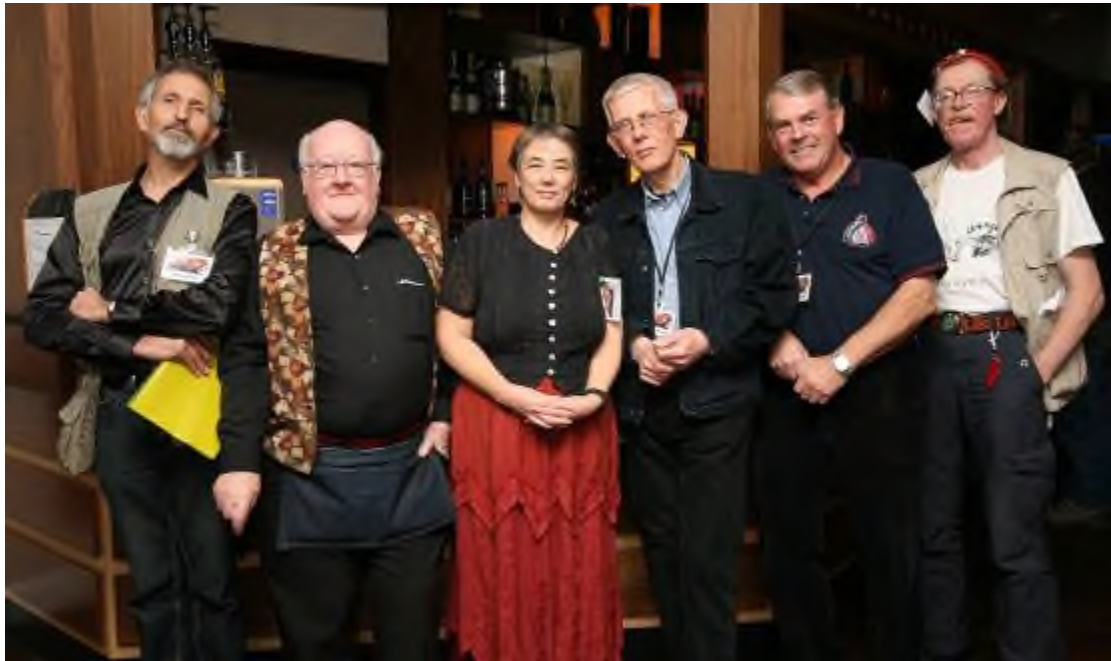
The Magnificent Six