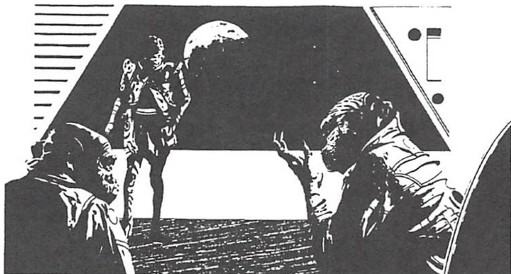
Illustration copyright by Vincent Di Fate

OCTOBER 6-8, 1995 RED LION HOTEL AUSTIN, TEXAS