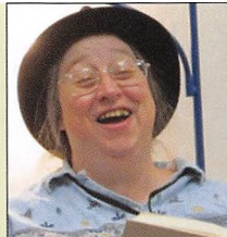
WisCon 37 Guest of Honor Jo Walton

There once was an international pixel-stained techno-peasant from Wales, who delighted Usenetters with tales. She wrote role-playing games! Among other fames, all lurkers supported her in email.