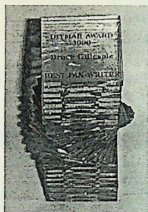
The 1990 Cologne Bottle