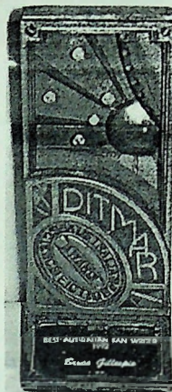
The 1992 Lewis Morley design