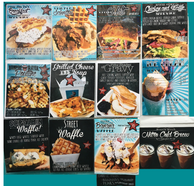
Eugene cuisine, food cart serving Ninkasi Brewing Co