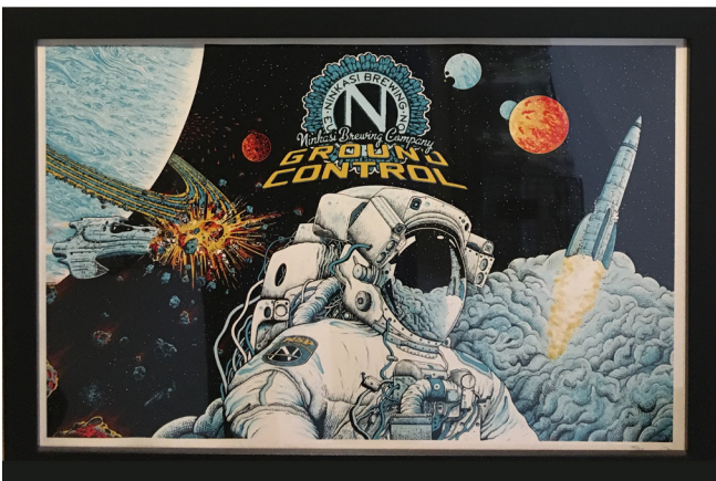
Ninkasi Brewing Co. art, Eugene OR