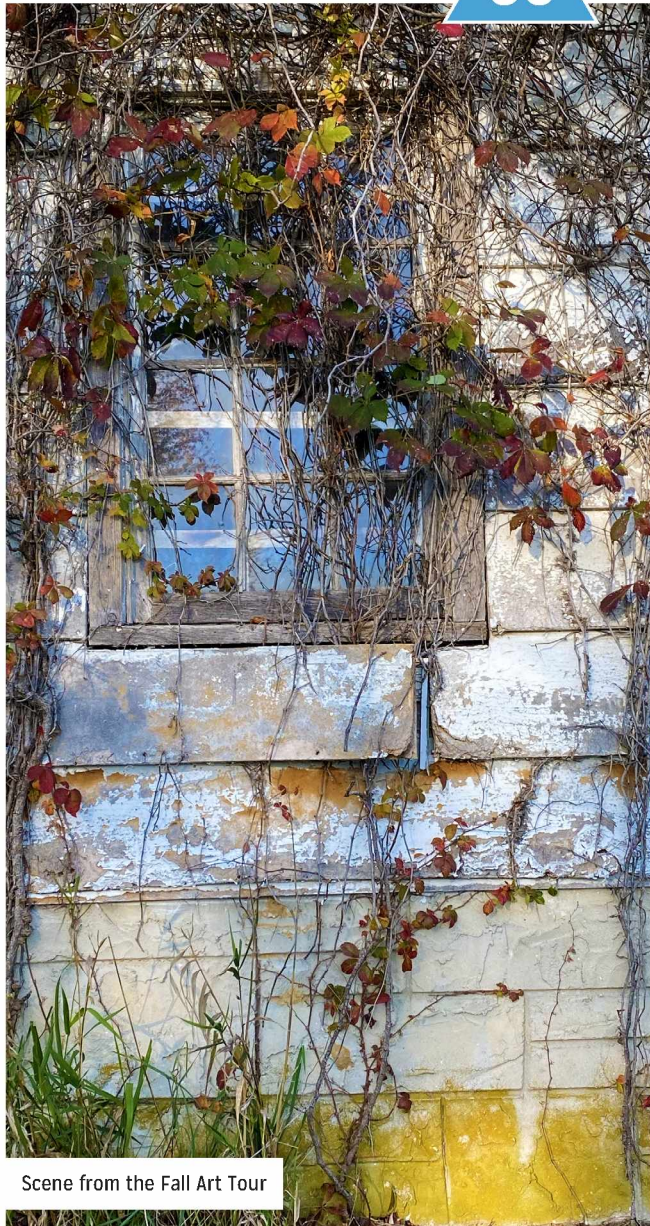
Scene from the Fall Art Tour