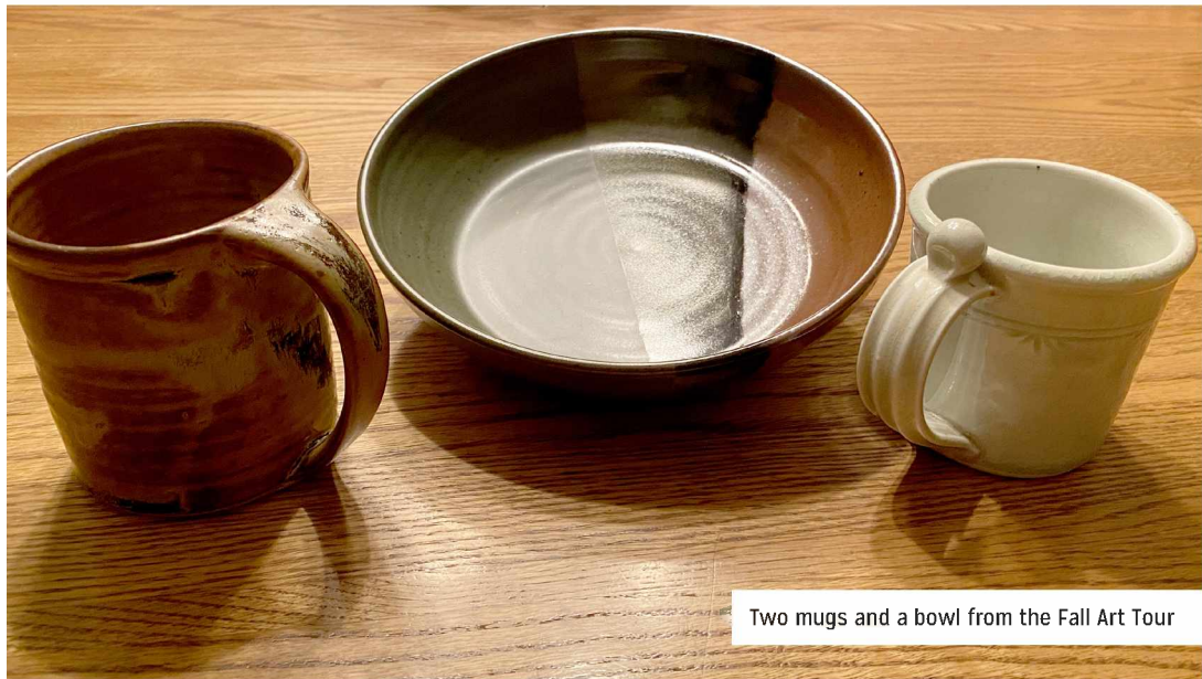
Two mugs and a bowl from the Fall Art Tour

I suspect that the mediocre films available this summer may also have a Covid-related explanation. Movie studios did not want to release their best films at a time when so few people had returned to theaters. Now that the drought is over, fingers crossed, I have high hopes for movies coming out in the next couple months.