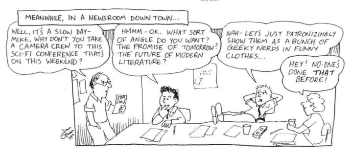
lan Gunn's view of the press coverage. It should be pointed out that this cartoon was drawn in November 1994, way before the insightful piece of reportage on the preceding page.