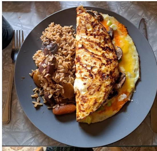
Cheese Louise – the way I feed myself when I get fancy