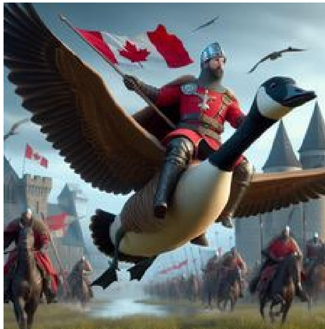
Early Canadian air force

Well, I was just summoned to the main house by my spouse. So I must go. Meanwhile, in Las Vegas, the opening ceremonies for Corflu are about to begin. Pub that ish!