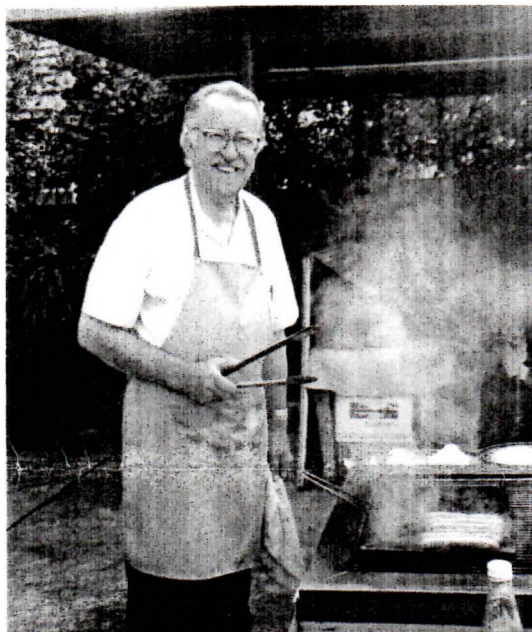
MERV at the Barbecue