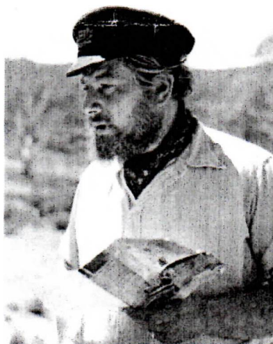
PETER USTINOV on the set of The Sundowners .