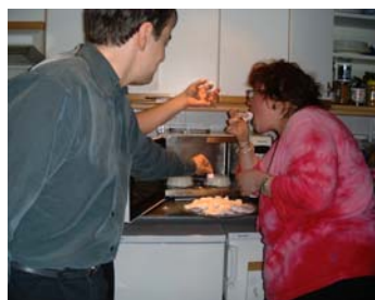
Safe disposal of laboratory waste