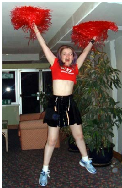
"Give us an X"

Pushing in our earplugs, we wandered past the prommers to buy some beer. "Two Waggledance, please." "Ah. Can't get the bees, you know."