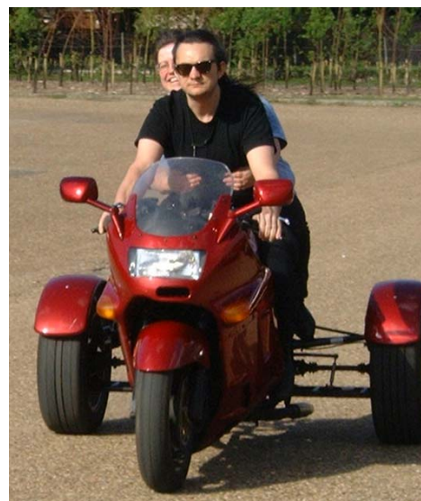
Can I bring my beer with me?