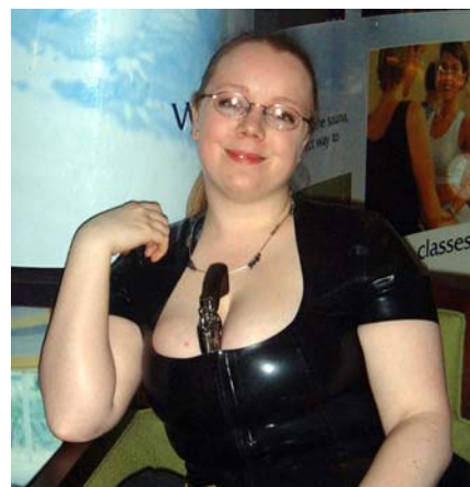
Is that a pistol in your Playtex or are you just pleased to see me?

The con badges were brilliant in every respect apart from completely failing to function as a name badge; the teeny tiny text invisible without a prolonged peer. For some reason loads of people seemed to have forgotten Flick's name.