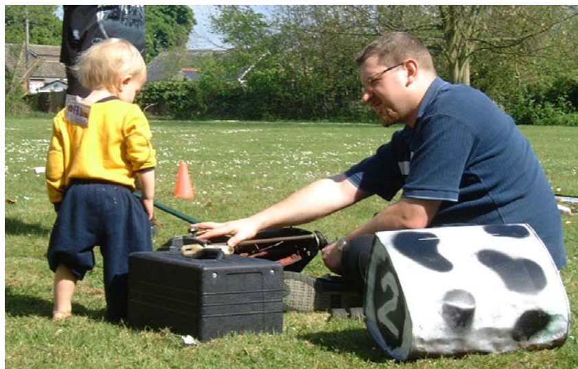
Zen and the art of Lawnmower maintenance

In the end, it turned out that wrapping people in plastic and duck tape was entirely too much fun to be