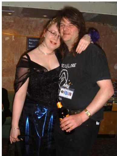
"Does your mother know you're out?"