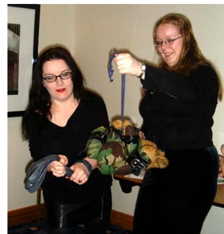
"You've been a very, very naughty bear"