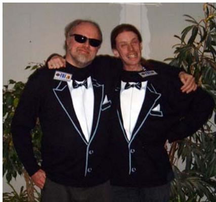
"Twin Geeks: 'It's so sad; they share a liver, you know'"