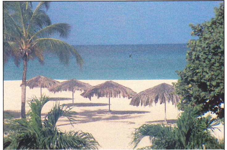
Eagle beach as seen from our balcony

Long distance isn't that much these days, so I called the property directly and worked out what days I needed to be there to get a corner ocean view room. I then went to www.delta.com to book the flight directly since you get an extra 1000 bonus SkyMiles for booking on their website. With the flight booked, I used the resort's website to actually book the reservation.