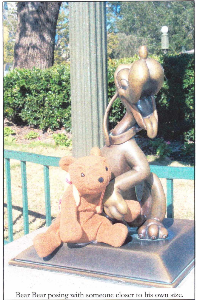
Bear Bear posing with someone closer to his own size.

So what do you do with all that spare time? Well, you can ride more attractions, but that involves walking around the park more and having to kill time waiting for the appropriate time to come. So you wander pass more food and souvenir kiosks, and you spend more time in the shops. The more time you're doing that, the more likely you are to spend more money. Isn't that the Disney way!