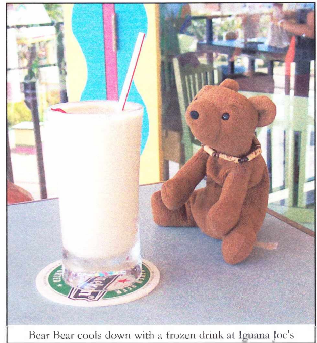
Bear Bear cools down with a frozen drink at Iguana Joe's