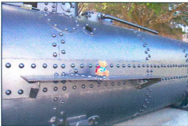
Ready to man the Confederate submarine CSN Hunley