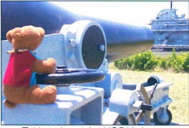
Taking aim at the USS Yorktown