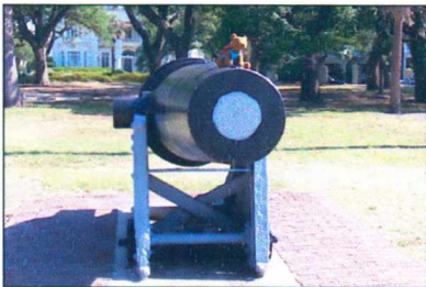
This guy probably gave the British hell!