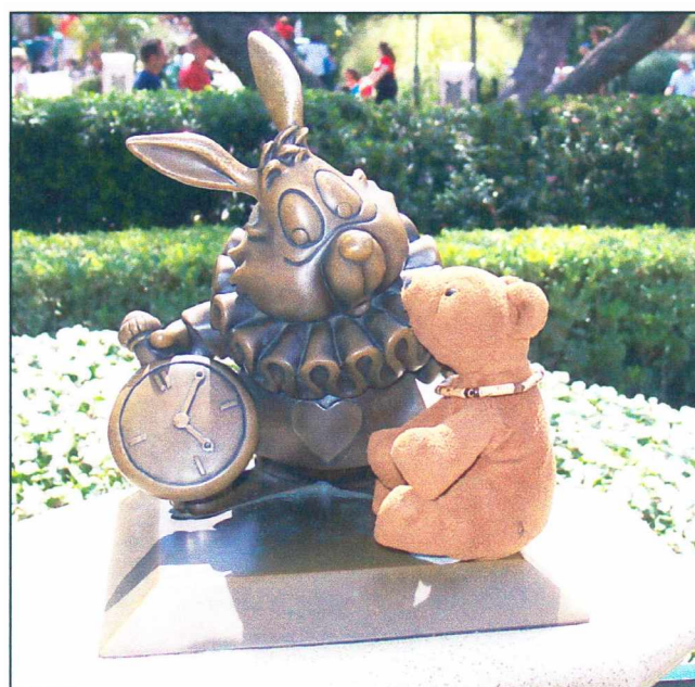
Bear Bear discusses this question of time that humans always seem to be obsessing about.

It seems to me there is a vast, very effective, conspiracy in place whose fiendish goal is to remove all traces of "location" from the entire country. Their plan is to make