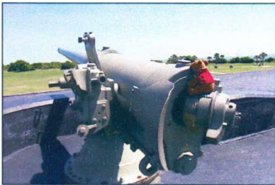
Preparing to fire a Spanish American war cannon