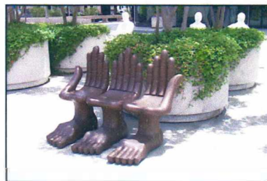
The K & B Plaza is not technically a museum but it does have a wonderful collection of modern art on display and easily accessible.

On nice days a wide range of vendors and artists gather in the square in front of the cathedral. Remember pickpockets think of themselves as artists!