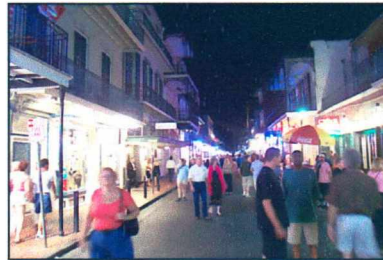
Bourbon Street remains the prime New Orleans attraction. Keep one hand on your wallet at all times!

We spent the rest of the trip browsing antique stores, visiting with friends, eating way too much and just enjoying the atmosphere. It was a fun trip and we will go back.