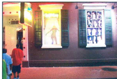
Inviting shadows entice you into establishments no different from those that fleeced the Yankee occupation troops and Franch trappers in other centuries.

The beautiful homes of New Orleans hint at the old, more cultured side of the Big Easy.