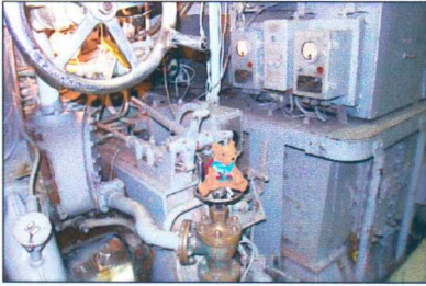
Diving the submarine USS Clamagore