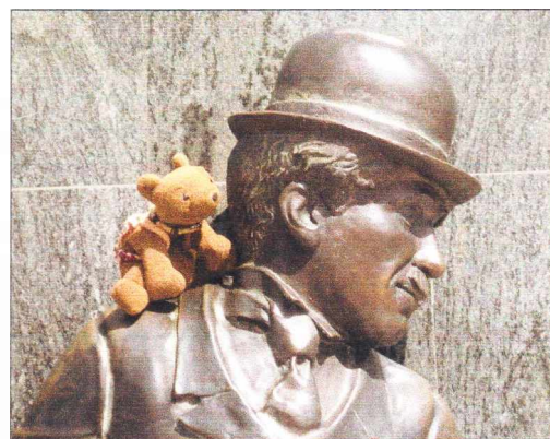
Bear Bear talks with Charlie Chaplin at the Hollywood Entertainment Museum

Seeing so many 3D films was very enlightening. The 33 films we saw were a representative slice of 50's movies. Instead of a gimmick, 3D was simply a part of the movie like sound or color. Of course, sitting through 5 movies a day could be considered too much of a good thing!