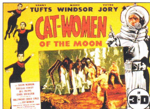
When available, movie posters were displayed before the movie