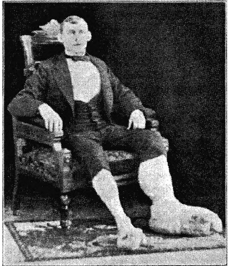
When elephantiasis was all the rage.

♥▼♥ That piece on Gays in the Boy Scouts from the Onion reminded me of an