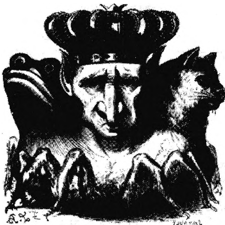
The Demon Bael