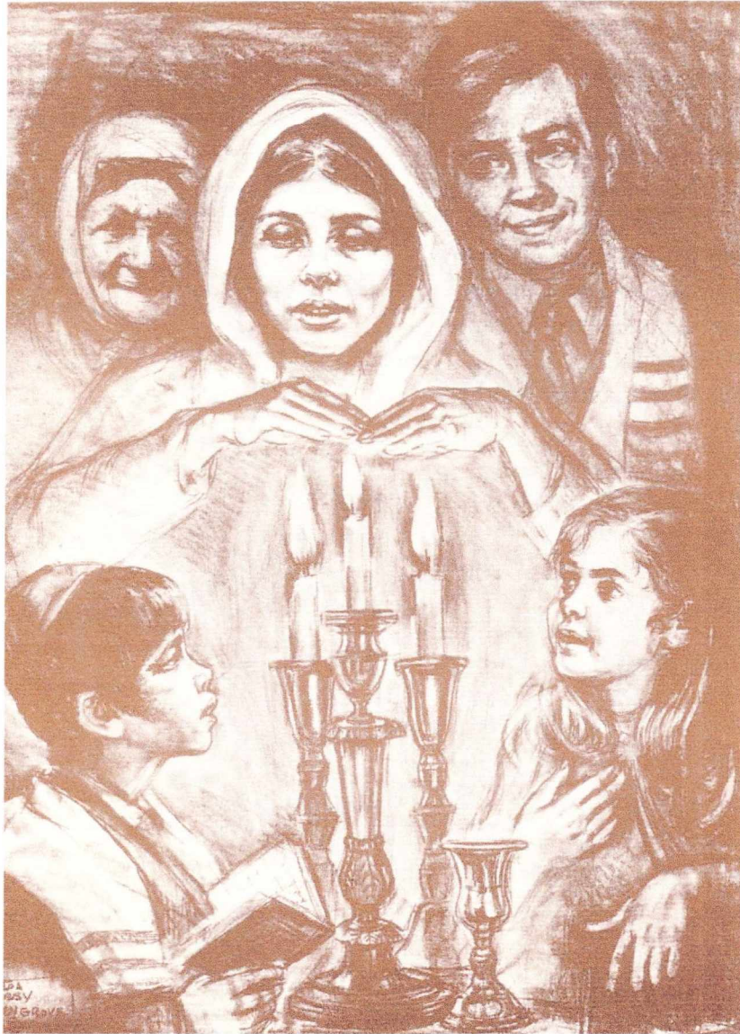
My brother and sister as religious. I think this is a joke of my mother's.